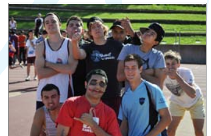
Drama at the Athletics carnival