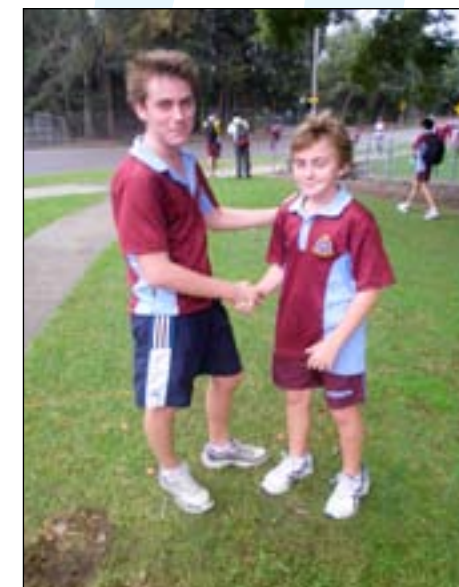
Congratulations on a good run