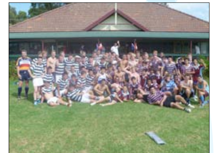
The Canadian boys enjoy a bit of Homebush hospitality