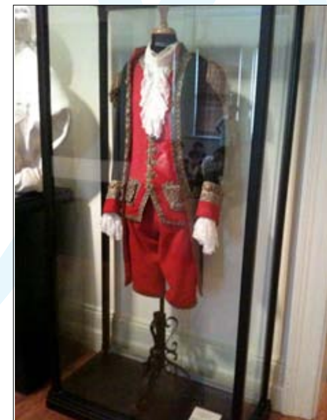
1970's school uniform