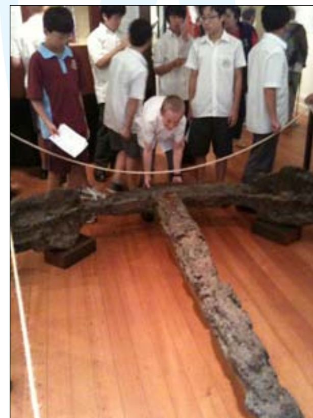
Its not that heavy!