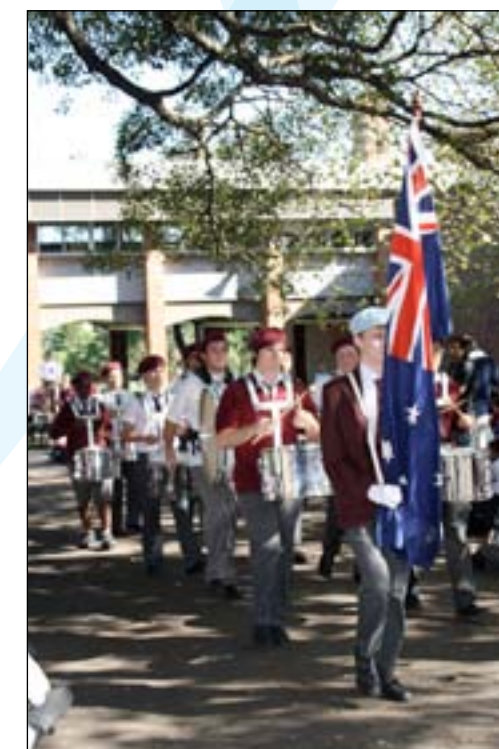
ANZAC Day ceremony at school