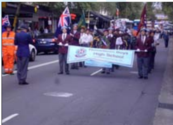
Homebush BHS marching in the city on ANZAC Day