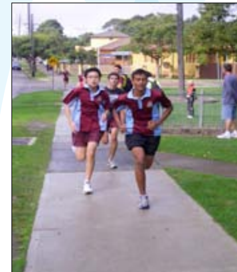
Chasing the pack